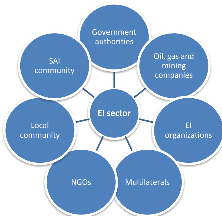
Figure 2: Overview of the key players and stakeholders in the extractive industries sector

Extractive industries usually refer to the oil, gas and mining industries. Extractive processes include oil and gas extraction, mining, dredging and quarrying, and it can be both on land and under water. The illustration below shows a simplified overview of the key players and stakeholders in the EI-sector.